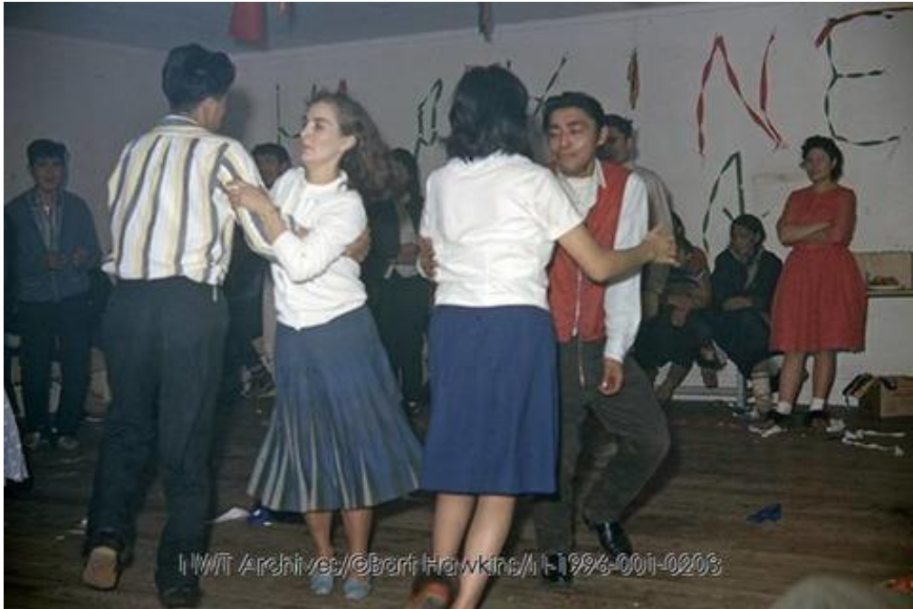
Fort Norman 1965. Photo by Bart Hawkins.

NWT Archives/©Bart Hawkins/1-1996-001-0203