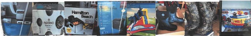
PORTABLE AIR CONDITIONER PADERNO POTS & PANS DEEP FRYER PORTABLE AIR CONDITIONER WATER SLIDE WOMANS BOOTS MENS BOOTS SIZE 11 SLAM DUNK