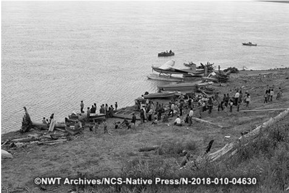
Fort Norman 1977. Boats and a float plane near Mackenzie River.