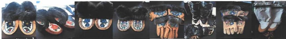
MENS SLIPPERS MENS SLIPPERS MENS SLIPPERS WOMANS SIZE 8 MENS GLOVES CAMOUFLAGE MENS GLOVES MENS MUKLUKS MUKLUKS &