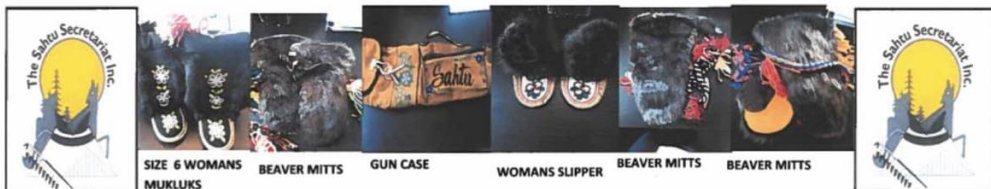
SIZE 6 WOMANS MUKLUKS BEAVER MITTS GUN CASE WOMANS SLIPPER BEAVER MITTS BEAVER MITTS