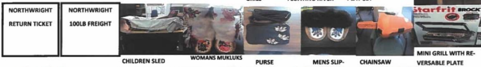
NORTHWRIGHT RETURN TICKET NORTHWRIGHT 100LB FREIGHT CHILDREN SLED WOMANS MUKLUKS PURSE MENS SLIP- CHAINSAW MINI GRILL WITH REVERSABLE PLATE