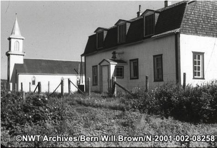
Fort Norman 1949.