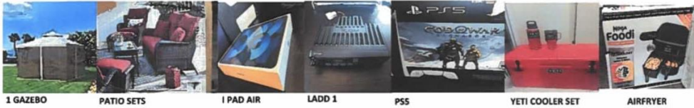
1 GAZEBO PATIO SETS 1 PAD AIR LADD 1 PS5 YETI COOLER SET AIRFRYER

For more information please Contact our office @ (867) 589-4719